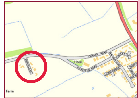
Contains Ordnance Survey data © Crown copyright and database 2017

The location of the plot provides easy access to the A9 for travelling north or south. The High Street in Tain has shops, cafes, restaurants and banking services can be found. The town has Asda, Tesco, Lidl and Co-operative supermarkets, a medical practice, primary and secondary education, a golf club and hotels. A number of recreational pursuits can be enjoyed in the area and there are extensive forest walks just a stroll away from the plot. The Highland Capital, Inverness, is 34 miles to the south where all major transport links can be found. A commuter train goes from Tain to Inverness daily.